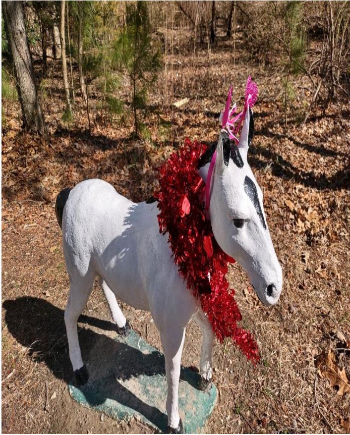
OUR SWEETHEART HORSE!

FIRST BOD MEETING OF 2023 SATURDAY FEBRUARY 25TH 10 AM at the Clubhouse