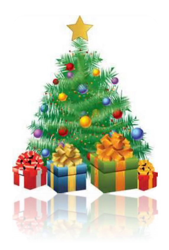
HAPPY HOLIDAYS TO ALL

Please drop off gently used and new donations for Kennille's Kupboards at the office.