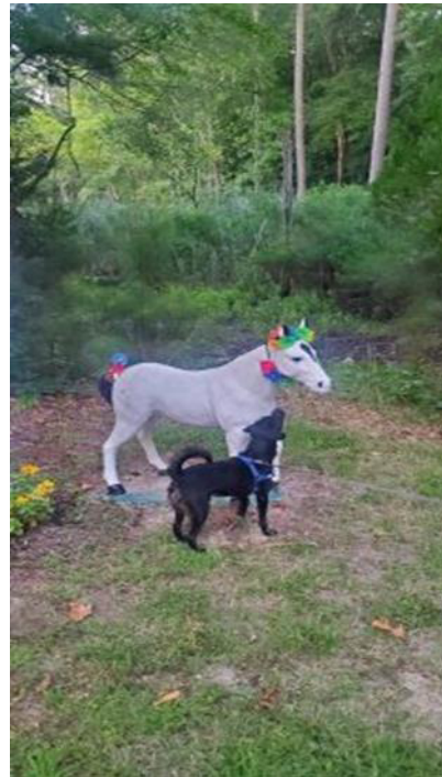
Gaitlin loving WHP horse-courtesy Lot 192