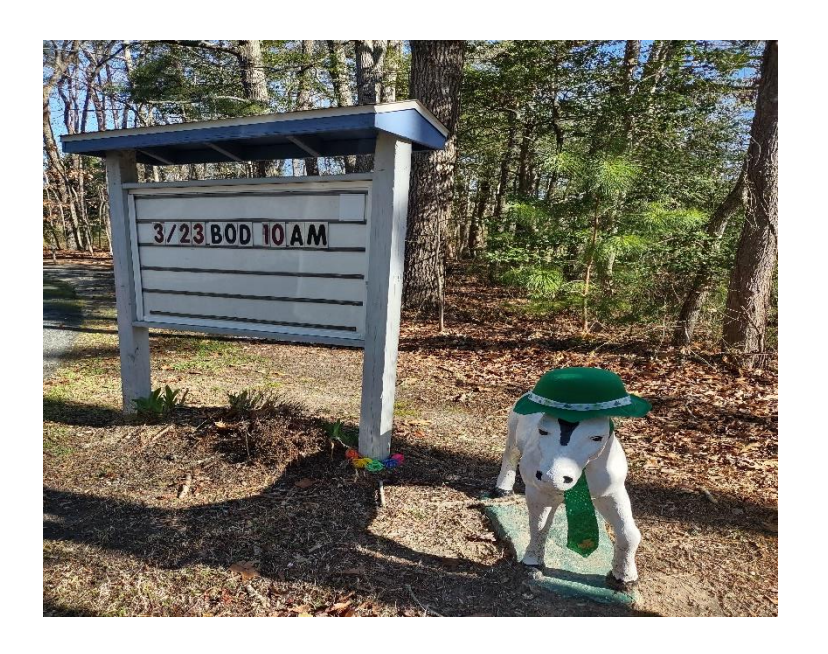
HAPPY ST. PATRICK'S DAY!!